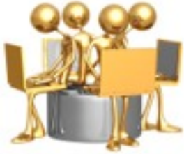
ONLINE LEARNING ZONE

We now have over a hundred and eighty learners regularly accessing our online pre-course modules and communities of practice.